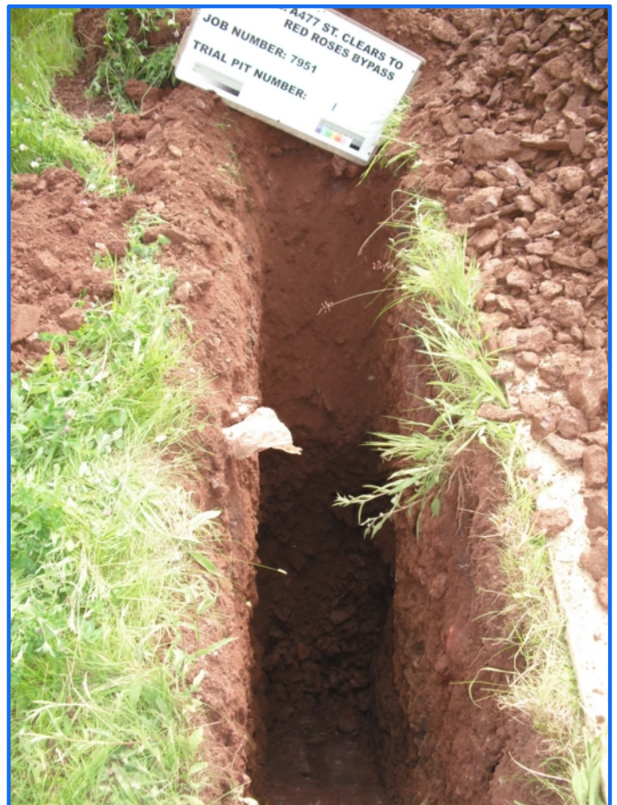
Right:- TP01 pit View of pit. Note wet area at bottom of pit.