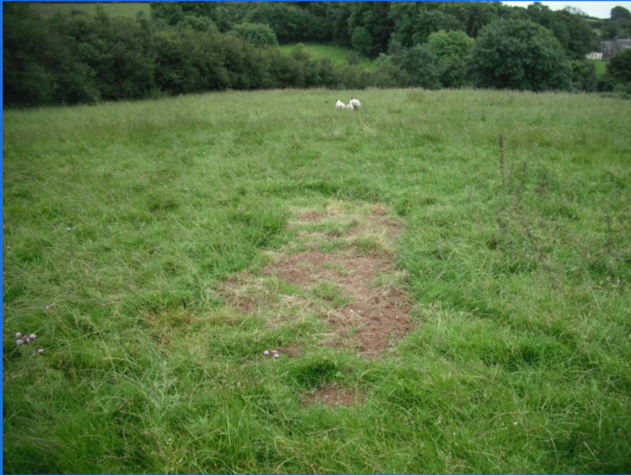
Above:- View of reinstatement of TP1