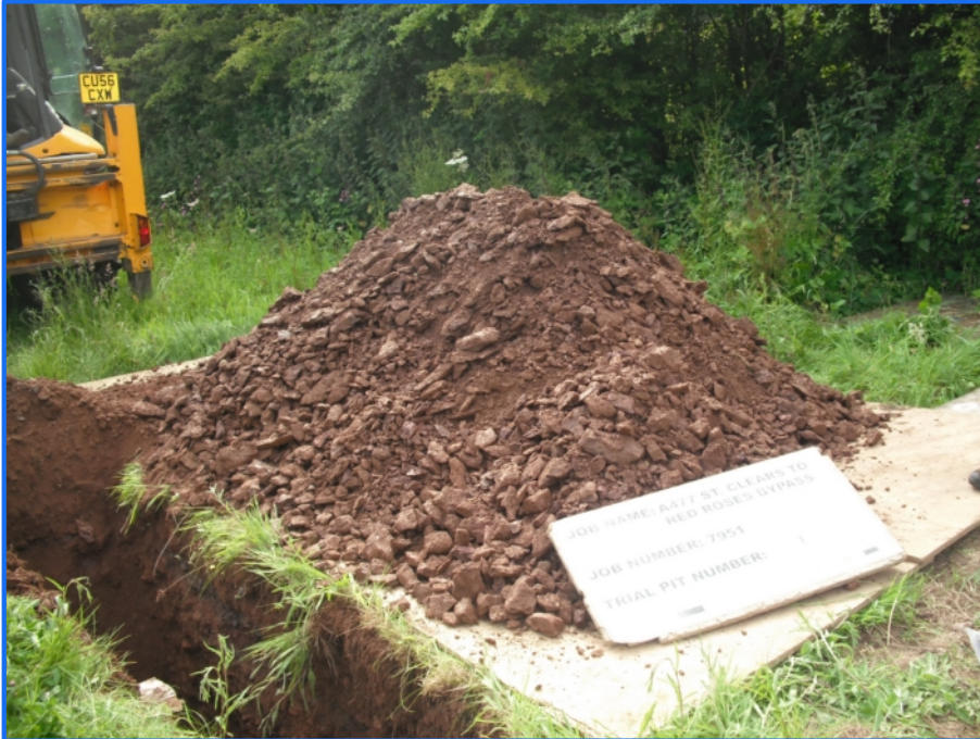
Above:- TP01 spoil Spoil for Trial Pit 1. Notice large amount of Cobbles